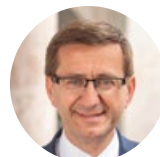
Mag. Thomas Stelzer State Governor of Upper Austria